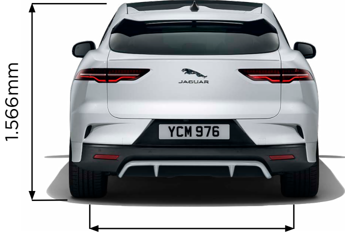
1.660mm - 1.662mm