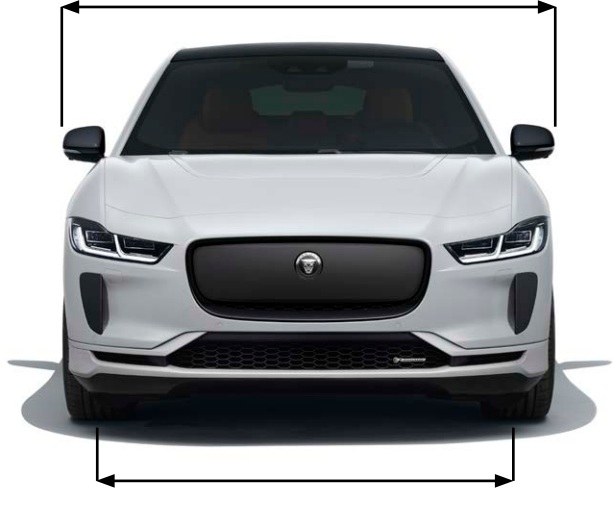
1.641mm - 1.643mm

Overall Width (inc. mirrors) 2.139mm (mirrors folded) 2.011mm